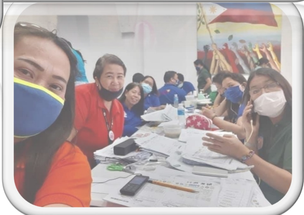
Repacking of relief goods