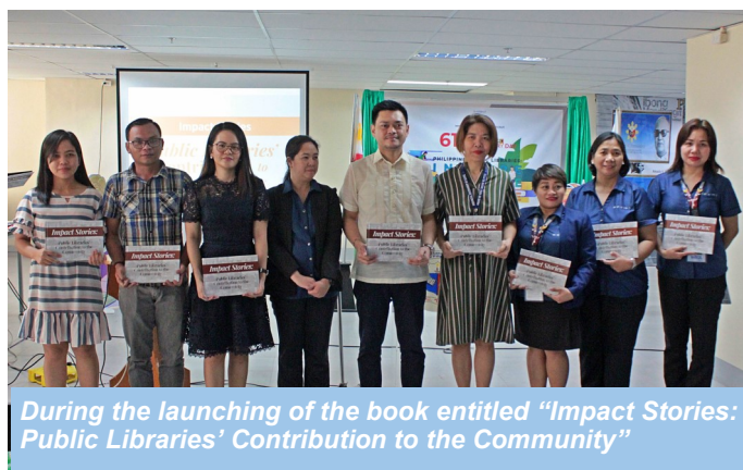
During the launching of the book entitled "Impact Stories: Public Libraries' Contribution to the Community"