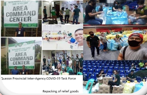
Quezon Provincial Inter-Agency COVID-19 Task Force